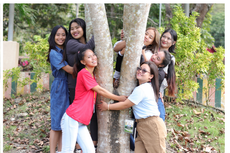
Ifugao State University joined DENR-Forest Management Bureau in their Tree Hugging Campaign on February 12-16, 2024.