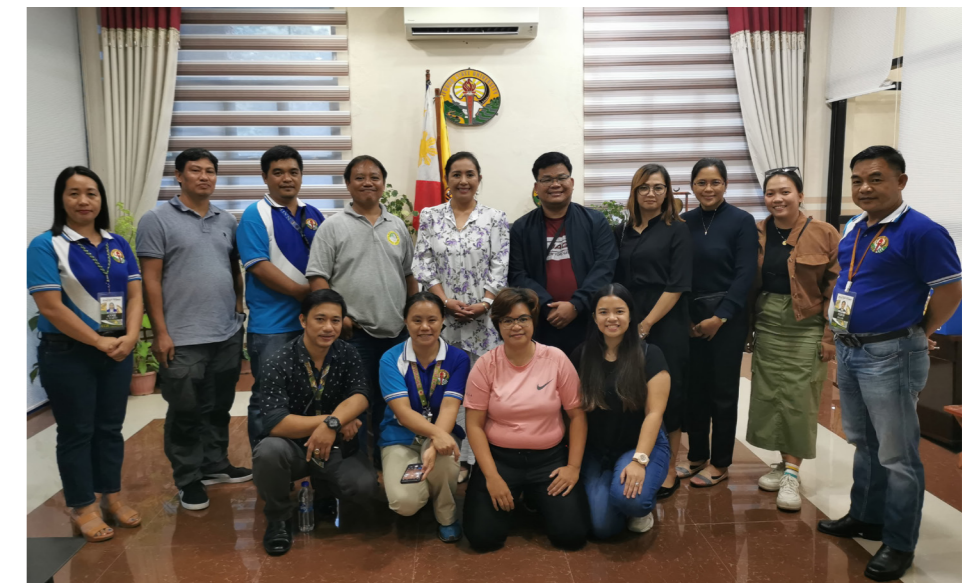
Laguna-based university...page 8

performing criminology schools in the country for years.