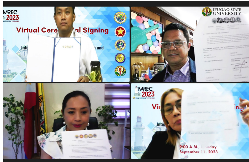
MOA with 4 SUCs for collaboration... from page 9

the future. May this partnership stand as a shining example of the impact that collaboration can have on the world of research and extension services."