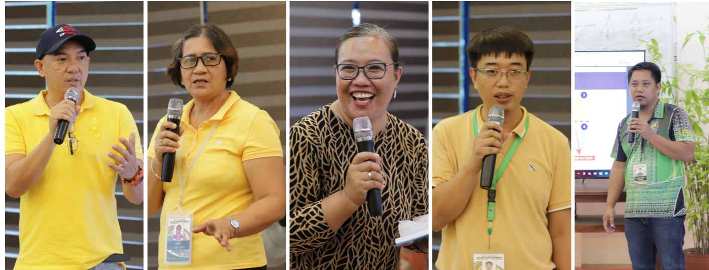
Univ Administrative Services Dep't holds... from page 21