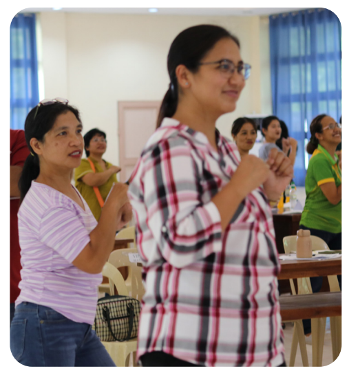
University HR Dep't trains... from page 12

This extension activity took place every Wednesday starting from March 8, 2023 until its culmination on May 22. Plans for its continuation in the upcoming semester or school year will be made. //