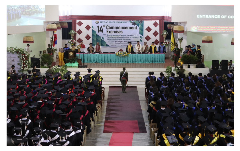
Lamut Campus grads... from page 8