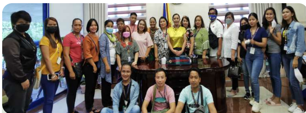
State Univ in Central Luzon... from page 3