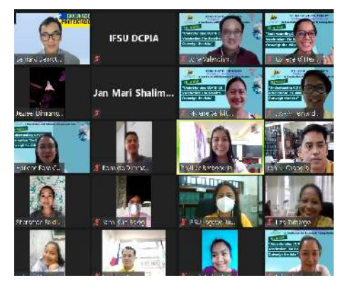
autoimmune disease are the ones needing medical clearance before getting the Covid-19 vaccine.

Moreover, he also stressed that patients with cancer and on chemotherapy, HIV/AIDS, those who have undergone a transplant, and those who have the